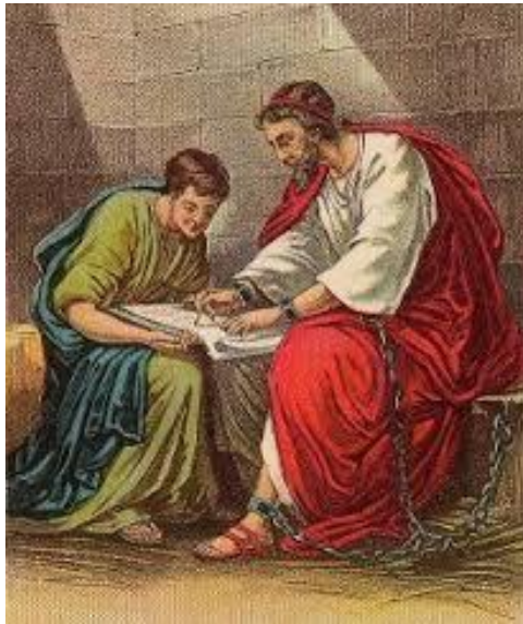
Paul Instructing Timothy