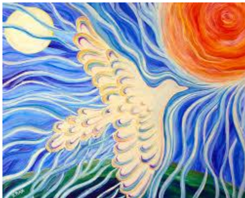
Peace Dove Painting by Erin Kuzmeskus

(Please share with those nearest you these or similar words: "Peace be with you.")